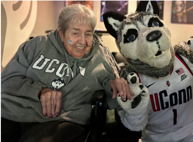
Let's go UCONN!