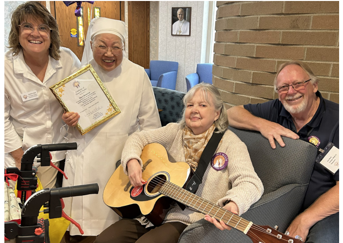
Six string lessons