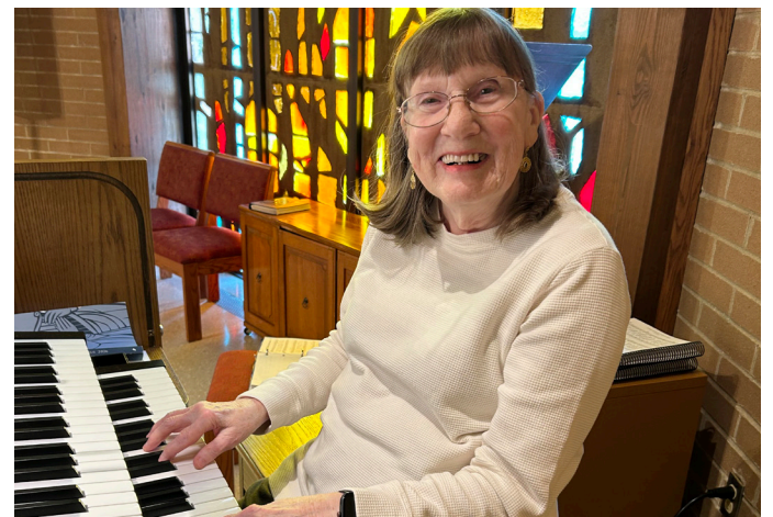
Hitting the right notes